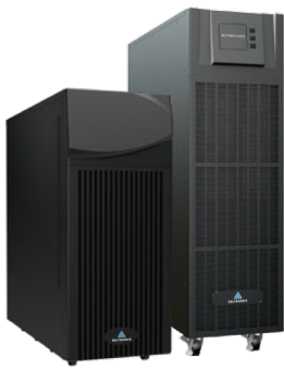
Battery cabinet (Optional)