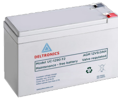
Optimized battery configuration 7Ah/9Ah (12V)